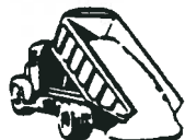
SAND & GRAVEL